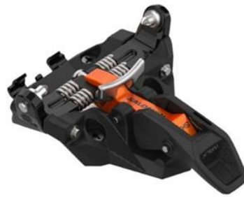
Recalled Salomon brand ski bindings (MTN SUMMIT 12 BR Orange/Burnt)