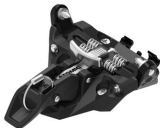
Recalled Atomic brand ski bindings (BACKLAND SUMMIT 9 LSH)