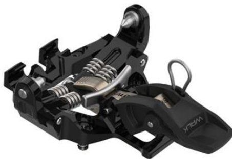
Recalled Salomon brand ski bindings (MTN TOUR Black/Titan)