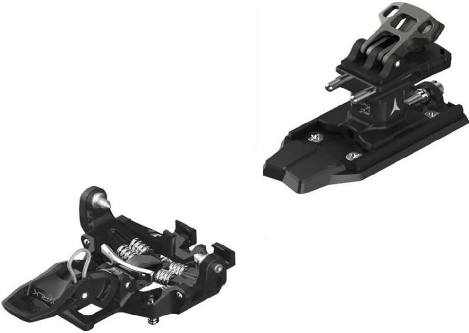
Recalled Atomic brand ski bindings (BACKLAND PURE Black/Gunmetal)