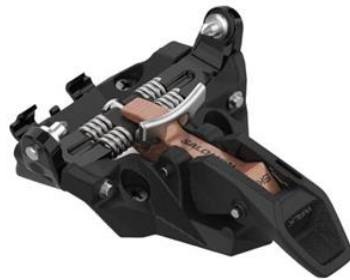
Recalled Salomon brand ski bindings (MTN SUMMIT 9 BR Titan)