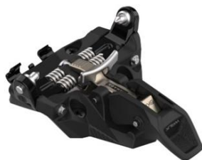
Recalled Armada brand ski bindings (TRACER SUMMIT 9 BR BLACK)