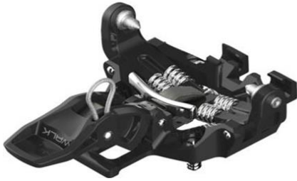
Recalled Atomic brand ski bindings (BACKLAND TOUR Black/Gunmetal)