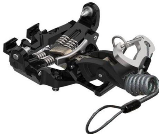
Recalled Salomon brand ski bindings (MTN PURE Black/Titan)