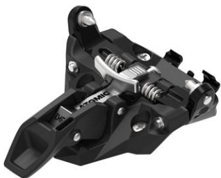
Recalled Atomic brand ski bindings (BACKLAND SUMMIT 5 BR)