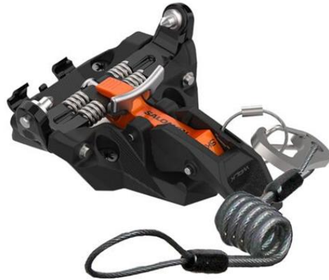
Recalled Salomon brand ski bindings (MTN SUMMIT 12 LSH Orange)