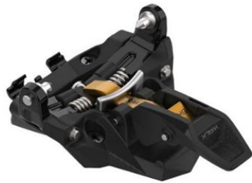
Recalled Salomon brand ski bindings (MTN SUMMIT 5 BR Gold)