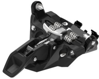
Recalled Atomic brand ski bindings (BACKLAND SUMMIT 9 BR)