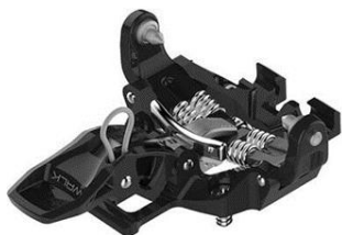
Recalled Armada brand ski bindings (TRACER TOUR Black)